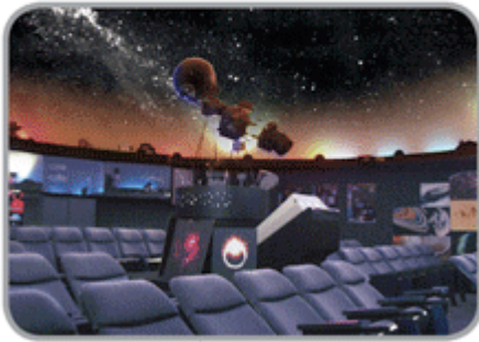
180 Degree Solutions For Dome & Planetarium Presentations